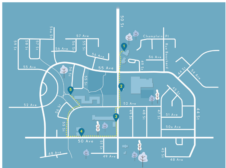
Figure 1. Winter Walk Map

We asked residents to take a walk through our city and respond to questions that asked for ideas for transforming Beaumont's winter experience. There were five boards, with two-to-three questions each in the locations shown in Figure 1.